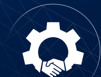
Joint Industry Partnership