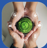
3. Sustainability Modelling