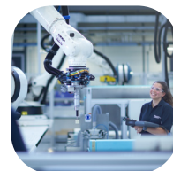
6. Delivery of Interventions

Contact us W: nccuk.com E: connect@nccuk.com