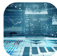
2. Data Collection