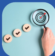
5. Road Mapping