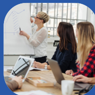
1. Goal Setting

We can help at a product, process or business level from Goal Setting through to Delivery of Interventions. Our tailored services are flexible to the size and complexity of your business and your challenge, where you can utilise individual stages or the entire framework.