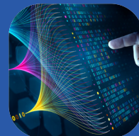
4. Analysis & Recommendation